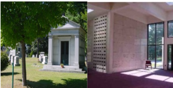
Private Mausoleums Mausoleum Niches & Crypts